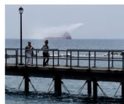
FCAO: 2019 Cyprus Summer of Hospitality Program Application Deadline May 5