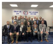
Port Jefferson AHEPA Chapter 319 Moving Forward