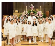
Piety, Faith, Traditions, Participation, Mark Holy Week at Holy Trinity of Charlotte